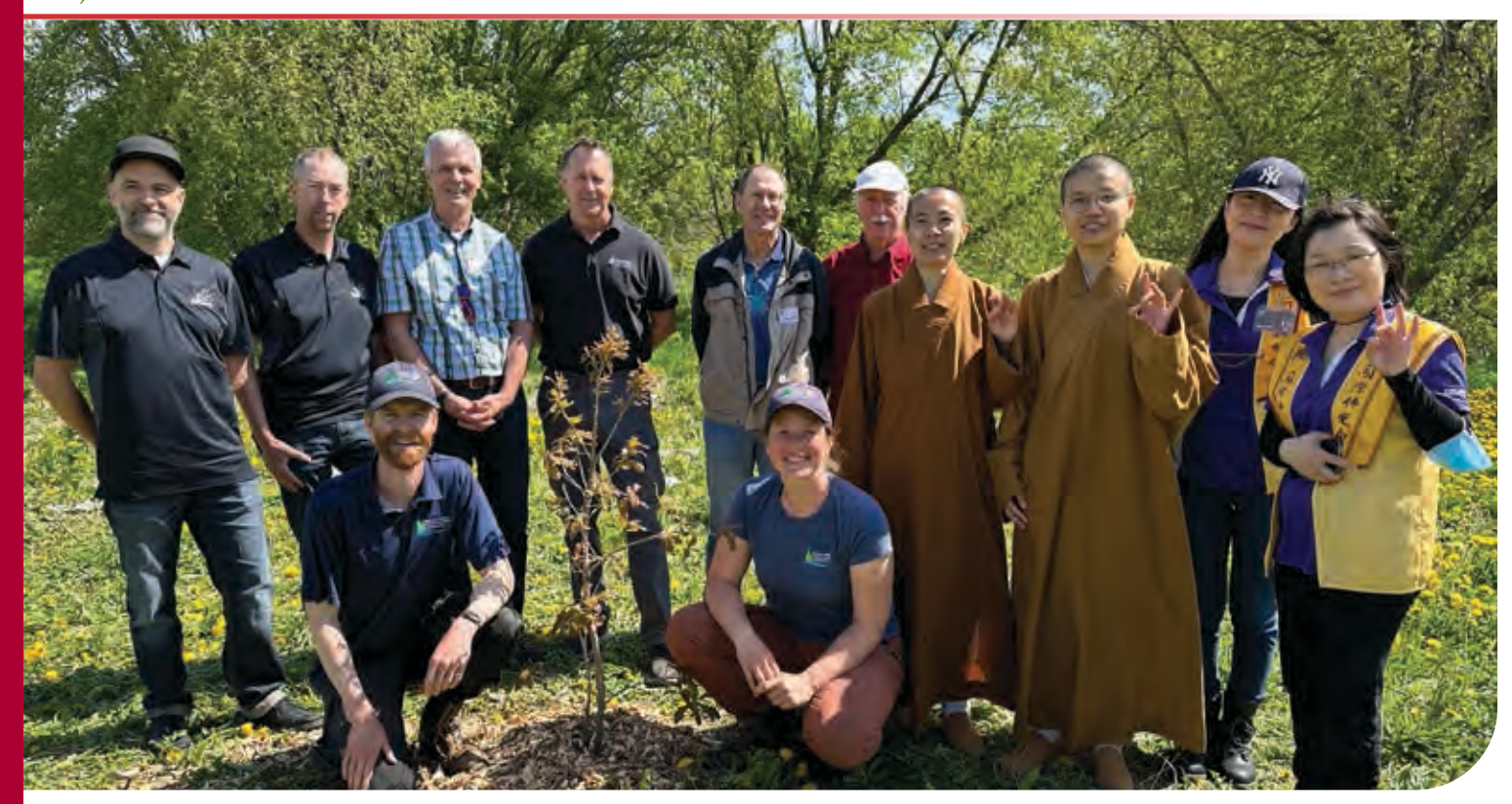
Several Carbon Neutral and Tree Planting partners joined RVCF board members, RVCA staff and many volunteers to celebrate the 7 millionth tree planted across the watershed in May.